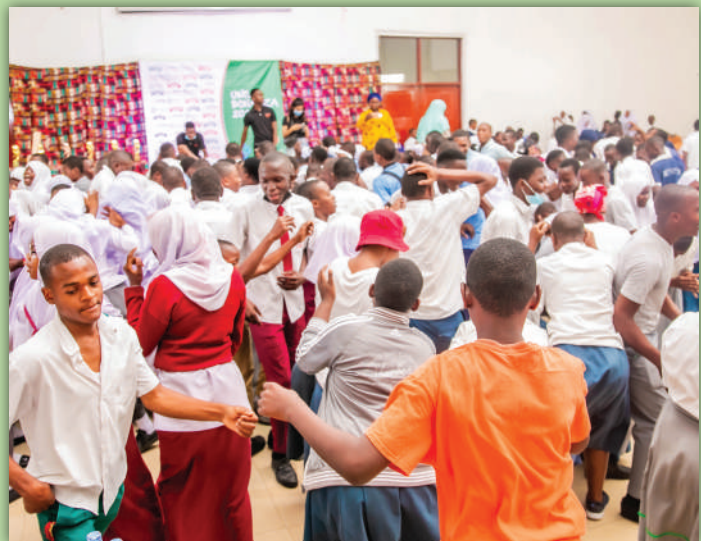
Students having fun on uwezo bonanza