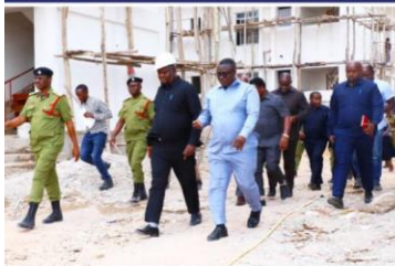
di ya Kufumu ya Bunge Mamba ya Nje, Ulitzi na Usalama Ililigomezwa na Makamu Mwenyenti wa Kimati... ipoti ya CAG yang'oa wanne TANOIL